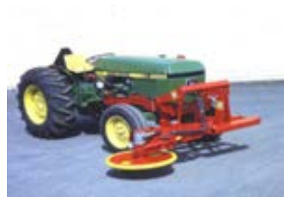
SINGLE DYNA-TRIM MOWER