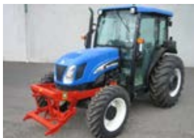
FRONT MOUNT 3-POINT HITCH