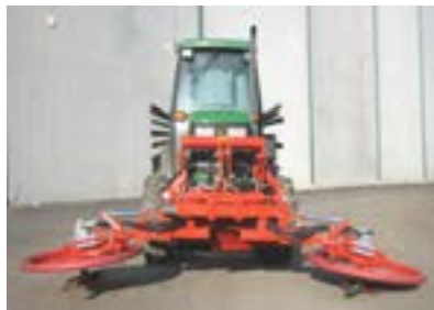
DOUBLE DYNA-TRIM MOWERS