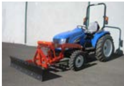
6 FOOT BLADE ATTACHMENT