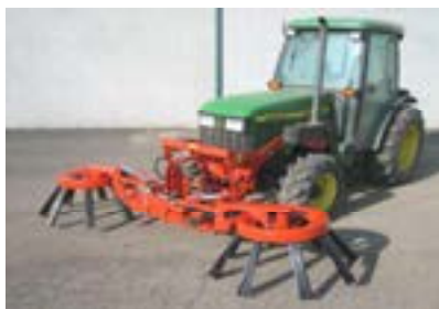
DOUBLE BRUSH SPIDER VINEYARD