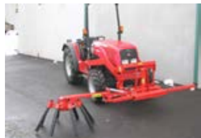
SINGLE ORCHARD BRUSH SPIDER