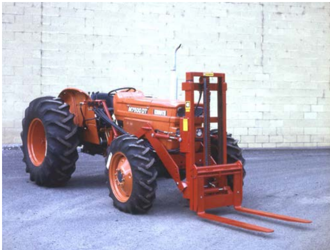
Front Mount Trans-Tier

Economically priced, the Trans-Tier is easily mounted on your tractor for seasonal use. It is an all around utility lift with a capacity of 2000 pound at a 24 inch load center. It is ideal for lifting awkward loads, transporting materials, stacking bins. And loading trucks. Mountings are available for nearly all makes of general purpose tractors. The Trans-Tier is made from high quality materials, Carriages are mounted on sealed bearings. A special rolled channel section of high carbon steel is used for the inner mast. All cylinders are constructed with hard chrome rods. These features assure efficient operation and years of dependable service. Lifting heights available are, 40, 60, 72, 84, 96 and 108 inches.