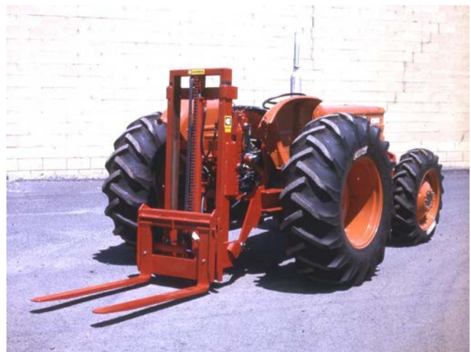
Rear Mount Trans-Tier